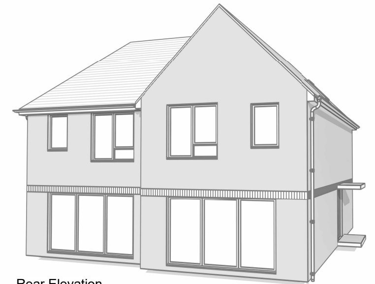
Rear Elevation Contextual 3D View